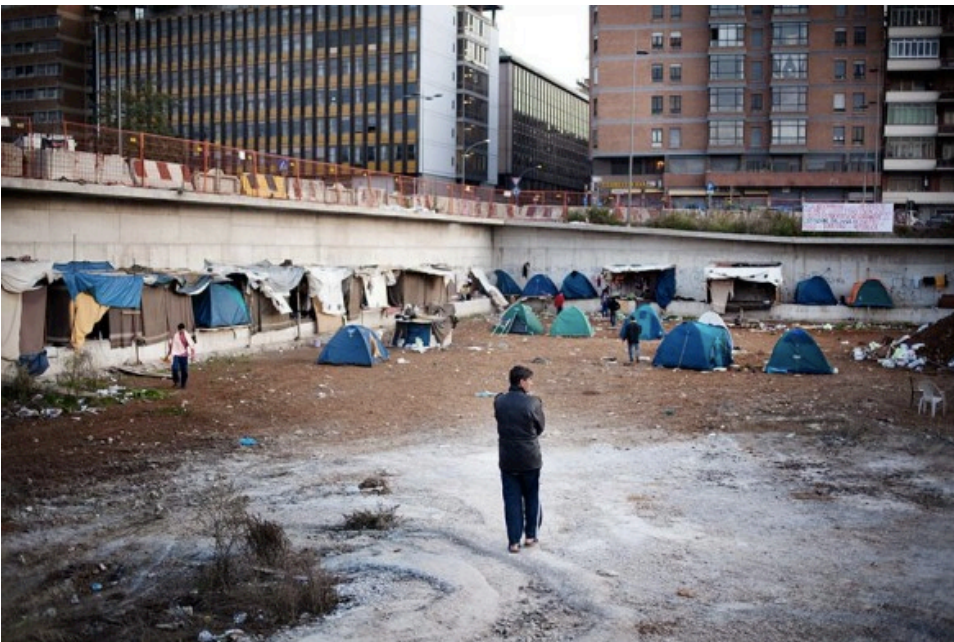
The “Hole” of afgan refugees