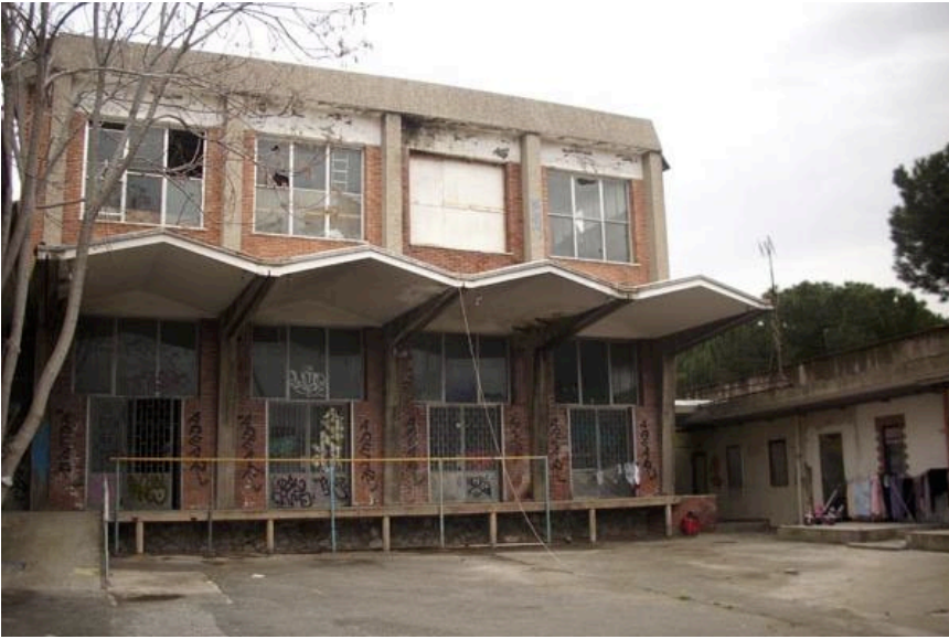
The entrance of Metropoliz