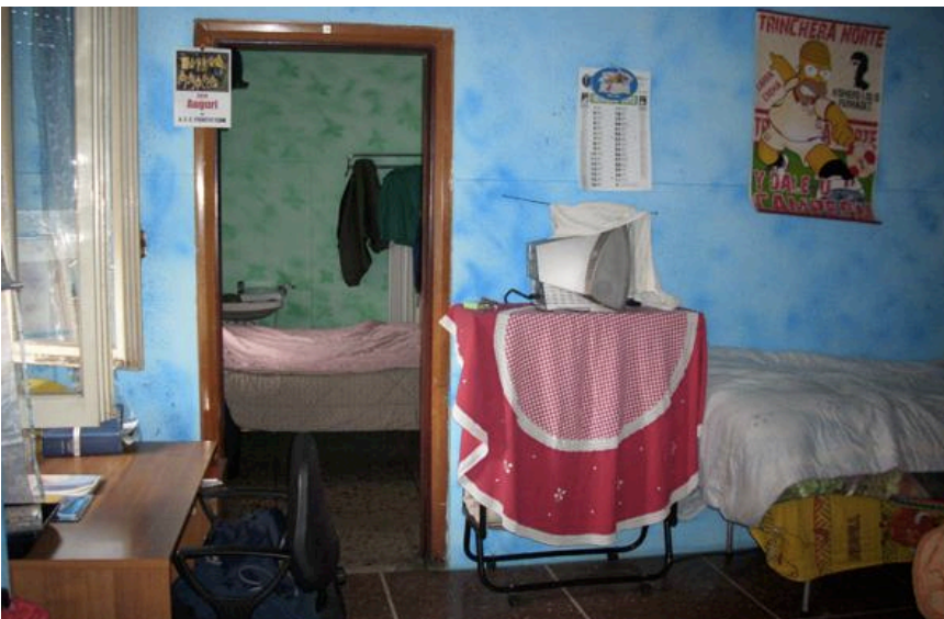
One of the houses built by a family unit