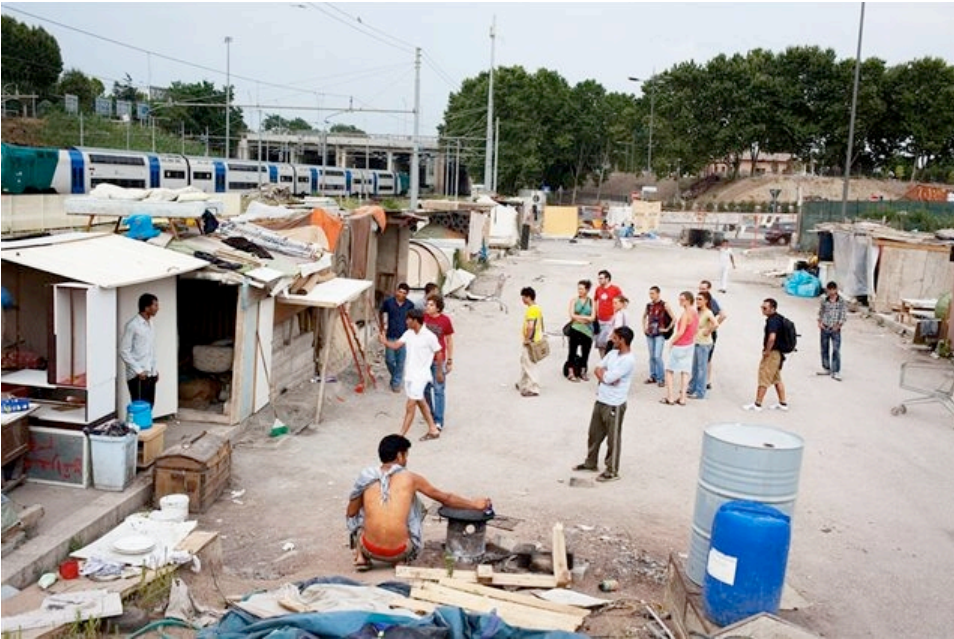
One of the settlements built after the destruction of the “Hole”